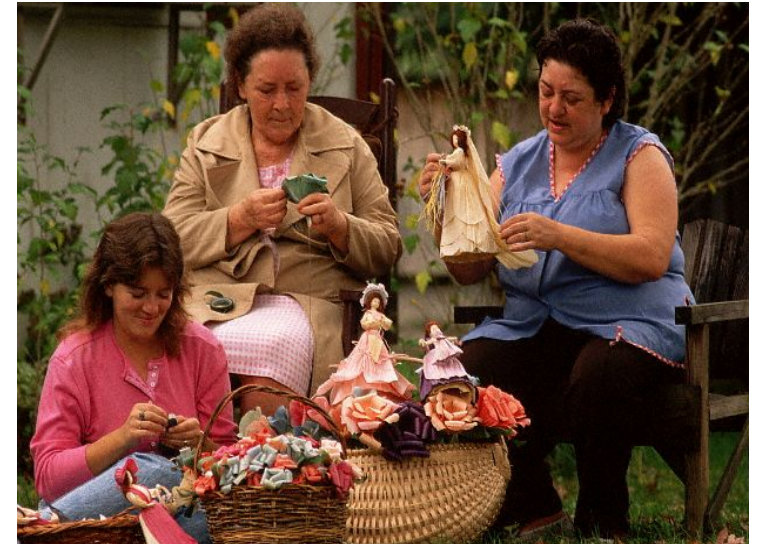
Task 2 - 3