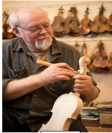
Task 2 - 2