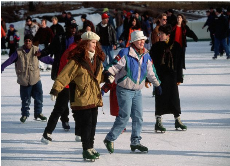
Task 1 - 2