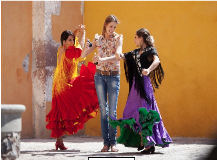
Task 2 - 1