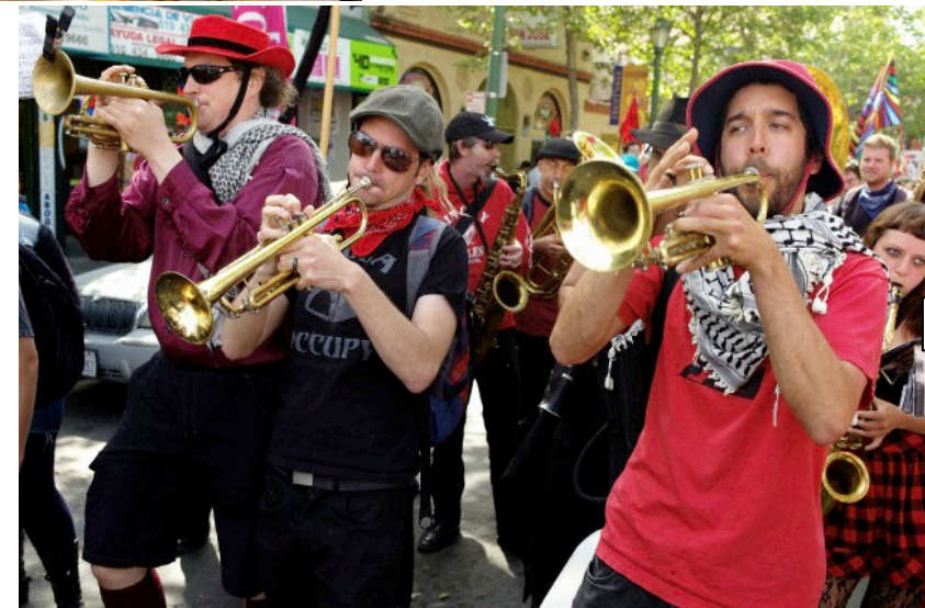
Task 1 - 3