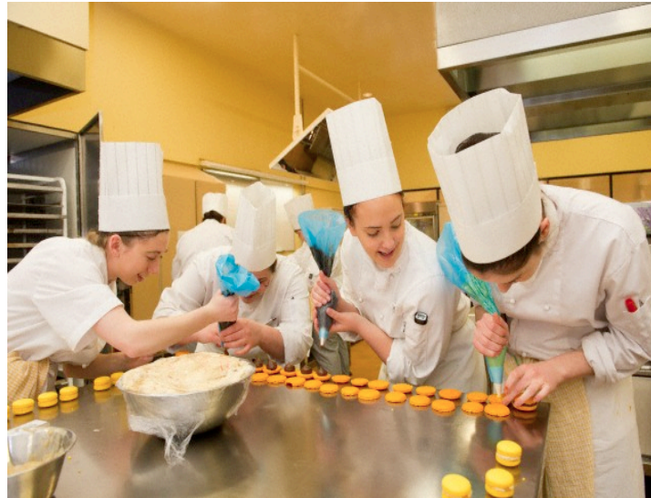
Task 1 - 1